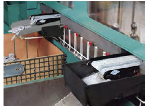
Low Profile Under Die Scrap Removal Conveyors

Elliptical Gear Driven Oscillating Conveyor to convey parts and scrap out of the press area. Three models for 50-, 125- and 250-pound loads. Supports multiple