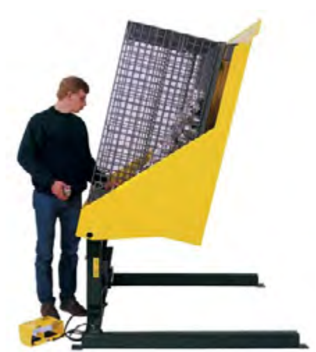
E-Z Reach Universal Tilter

Ergonomic Material Handling Equipment To Make Work Faster, Safer And Easier. Lift Tables, Container Tilters, Turntables, Work Tables, Stackers, Pallet Handling Equipment