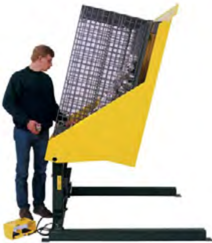
E-Z Reach Universal Tilter

Ergonomic Material Handling Equipment To Make Work Faster, Safer And Easier. Lift Tables, Container Tilters, Turntables, Work Tables, Stackers, Pallet Handling Equipment