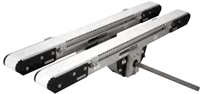
Dorner 2200 series timing belt gang drive