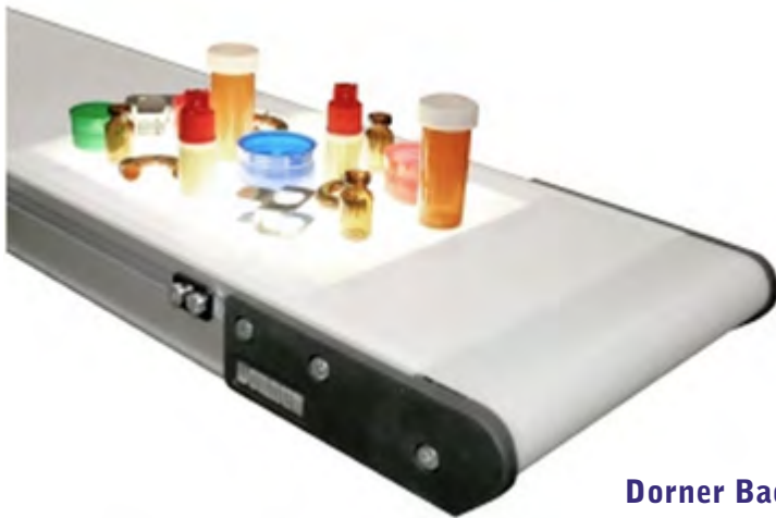
Dorner Backlit Conveyors for inspection