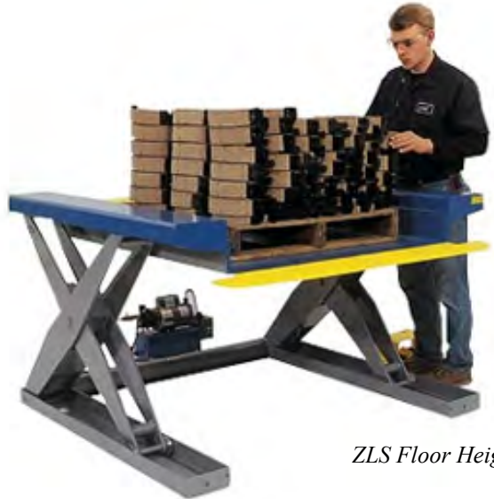
ZLS Floor Height Lift

Unique pan style design accommodates any type of container. Because the unit is essentially flush to the floor when in the lowered position, this tilter can be easily loaded with hand cart and hand pallet trucks.