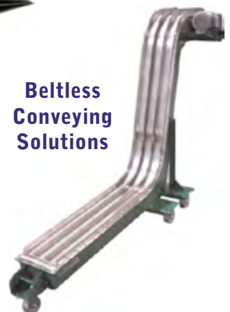
Beltless Conveying Solutions