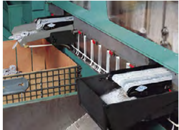
Low Profile Under Die Scrap Removal Conveyors

Elliptical Gear Driven Oscillating Conveyor to convey parts and scrap out of the press area. Three models for 50-, 125- and 250-pound loads. Supports multiple conveying trays and extended length crossbars for wide bolsters.