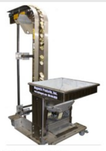
MPI mag belt conveyor