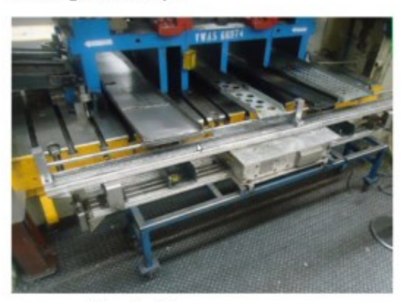
Electric shaker conveyor