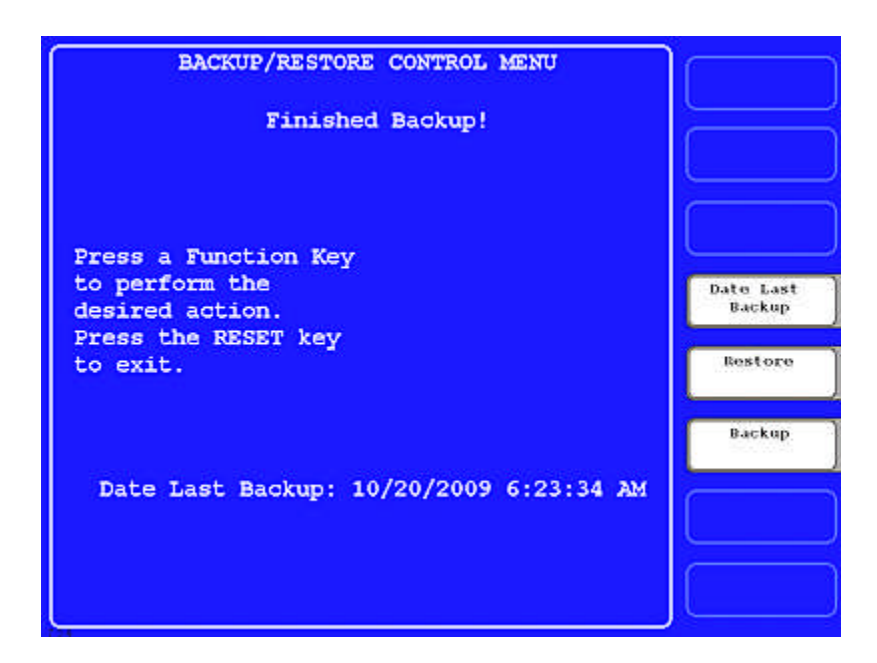
Info Center Option

• If your SmartPAC 2 is on your network, you can use the built-in backup and restore capability. You simply specify a destination for the SmartPAC's memory files (usually a folder on a network server) and select 'backup' from the SmartPAC 2's Backup/Restore Control Menu. All of the tool number settings and initialization information for the SmartPAC 2 will be copied to that directory. The date of the last backup is also noted on the screen (this can be checked at any time). To restore settings, use the <a href="SmartView Web Interface">SmartView Web Interface</a> to tell the SmartPAC 2 where to find the settings, and select "Restore". It's that simple.